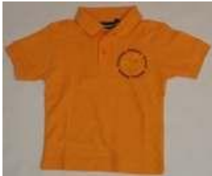
Yellow Polo Shirt